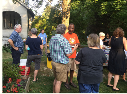
Neighbors gather at Radnor Rd and Winston Ave for the last Progressive Porch Party in September 2019.